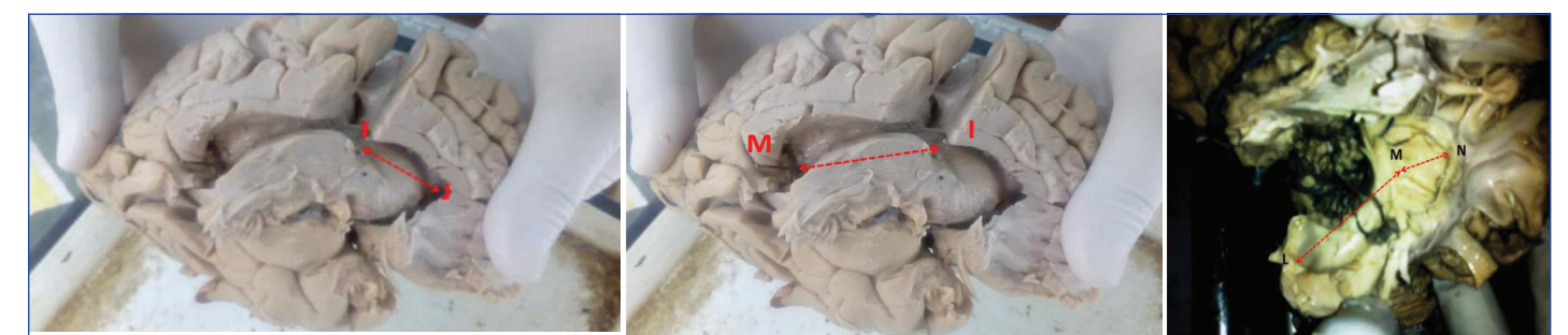
[Table/Fig-1]: Median sagittal section showing frontal horn of lateral ventricle: I-interventricular foramen, J- tip of frontal horn, IJ-length of frontal horn. [Table/Fig-2]: Length of the body of lateral ventricle: measurements taken from inter ventricular foramen (I) to the centre collateral trigone (M) on both sides. [Table/Fig-3]: Dissected brain specimen showing posterior and inferior horn of lateral ventricle ML- length of inferior horn, MN- length of posterior horn. M- Centre of collateral trigone. (Images from left to right)

During the study, a total of 127 brain specimens were obtained from individuals aged 10 years to 70 years and above. Out of the 127 specimens, 78 were male brains and 49 were female brains.